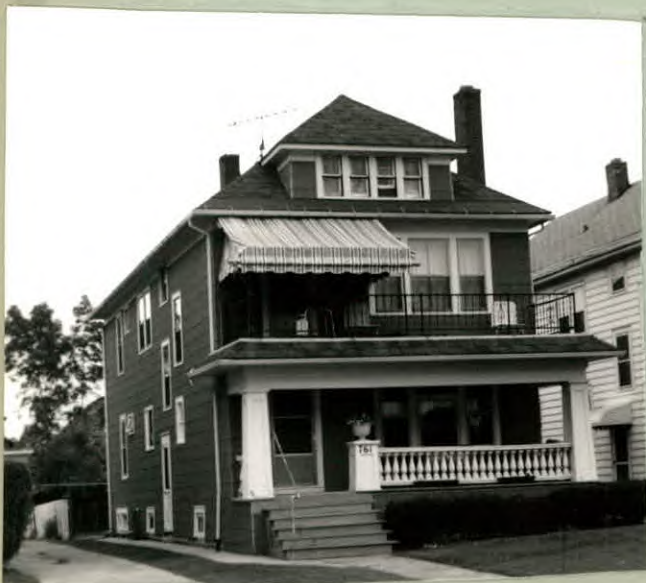
12. PHOTO: 4-13a