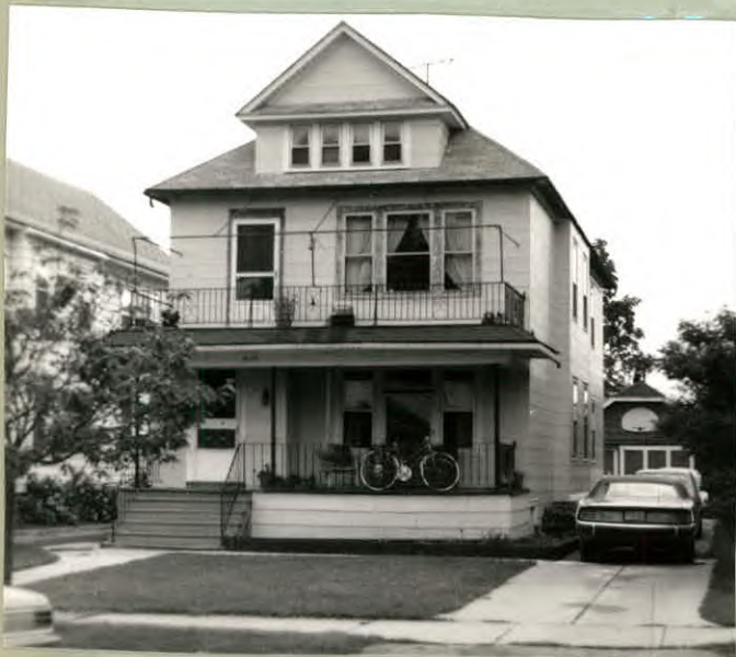
12. PHOTO: 4-15a