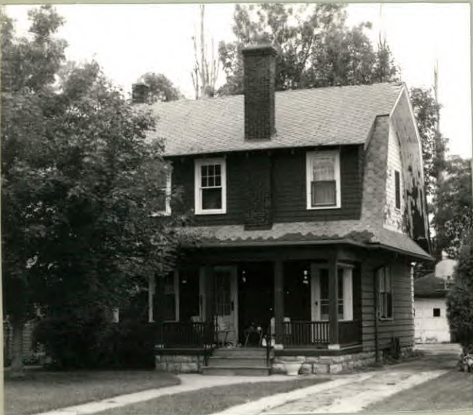
12. PHOTO: 7-17a