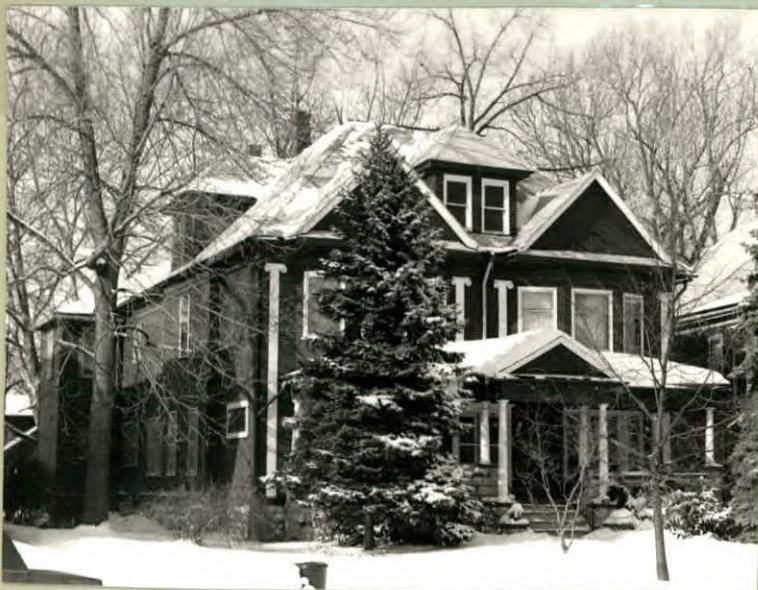
12. PHOTO: 22-30a