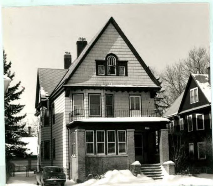
12. PHOTO: 22-28a