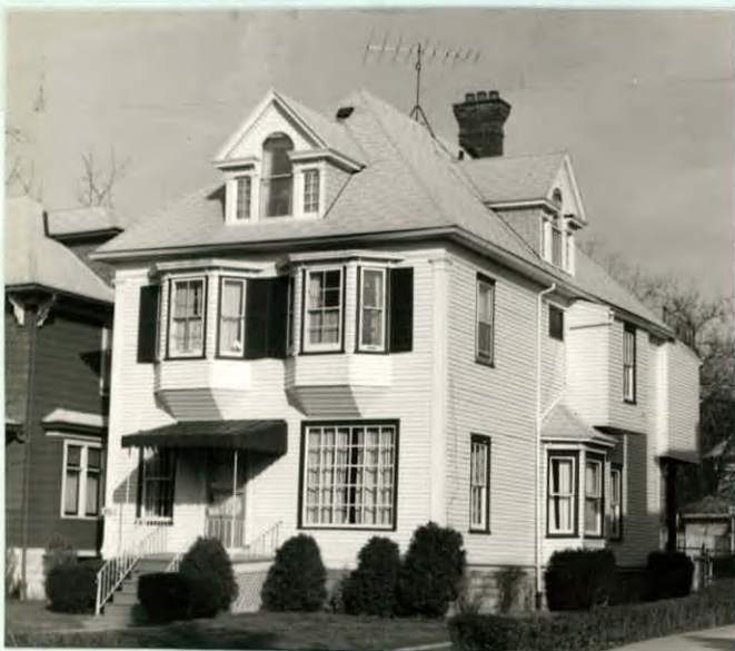
12. PHOTO: 25-13a