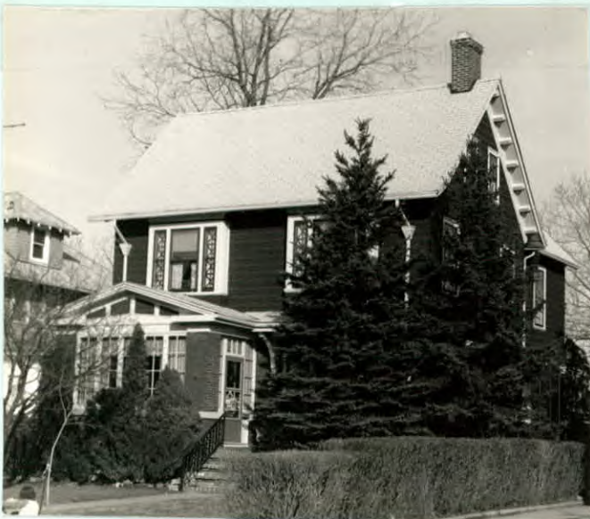
12. PHOTO: 25-11a