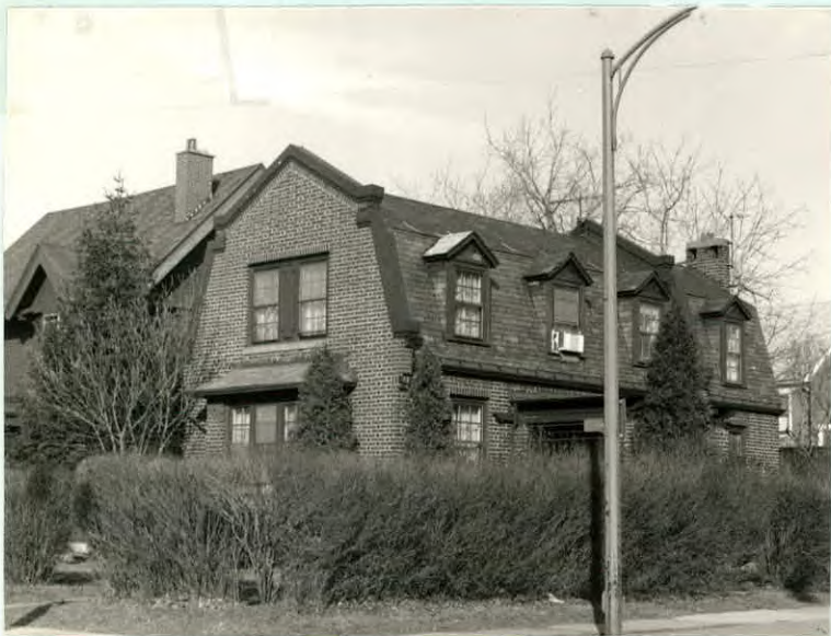
12. PHOTO: 25-8a