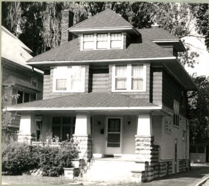
12. PHOTO: 1-19a