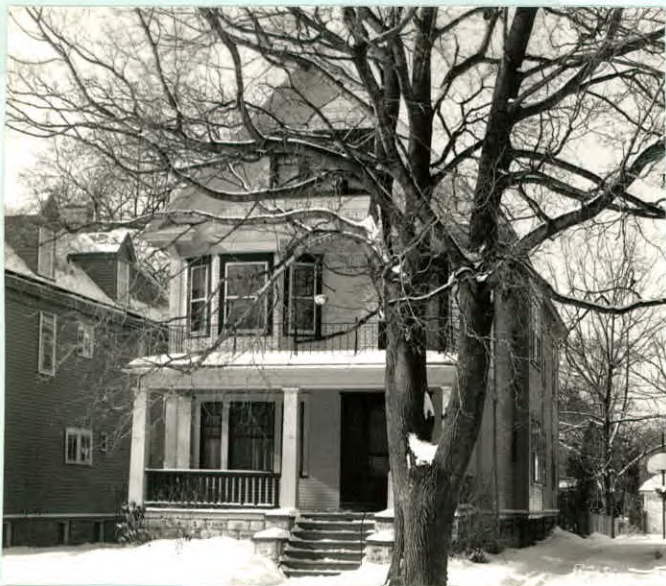
12. PHOTO: 22-14a