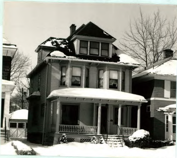
12. PHOTO: 22-10a