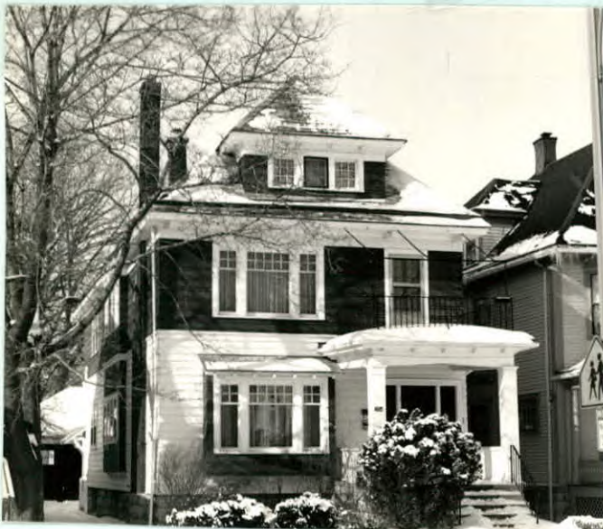
12. PHOTO: 22-9a