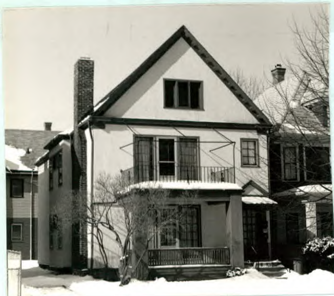
12. PHOTO: 22-7a