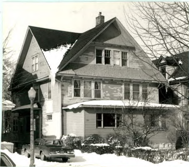
12. PHOTO: 22-1a