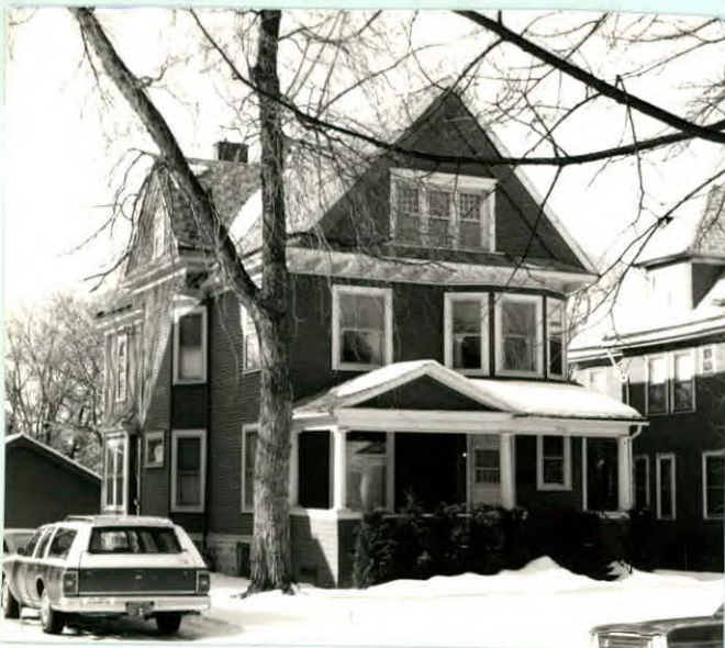
12. PHOTO: 21-36a