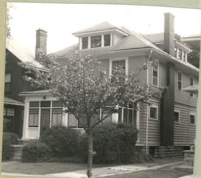
12. PHOTO: 5-2a