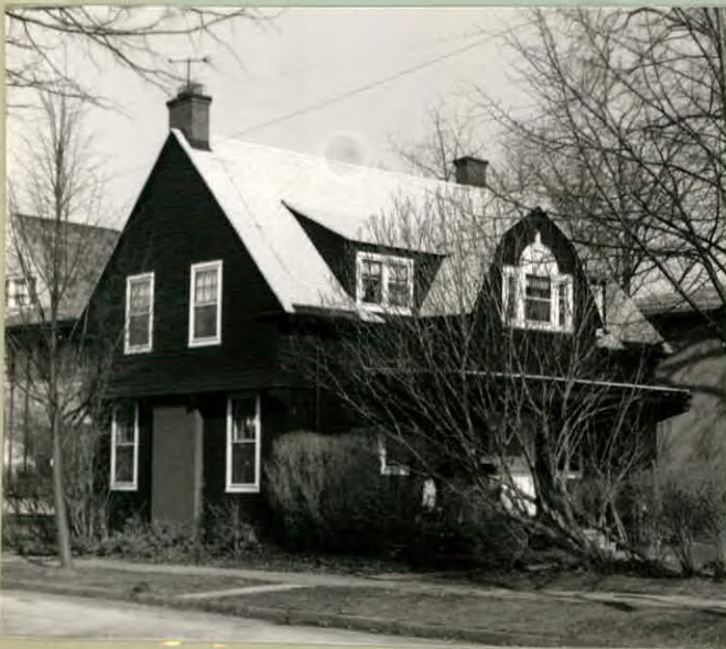
12. PHOTO: 24-17a