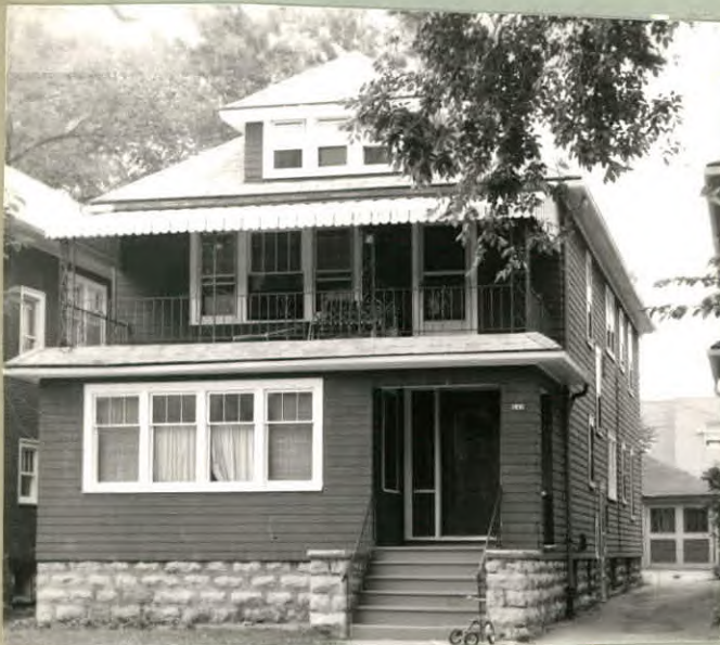
12. PHOTO: 10-1a