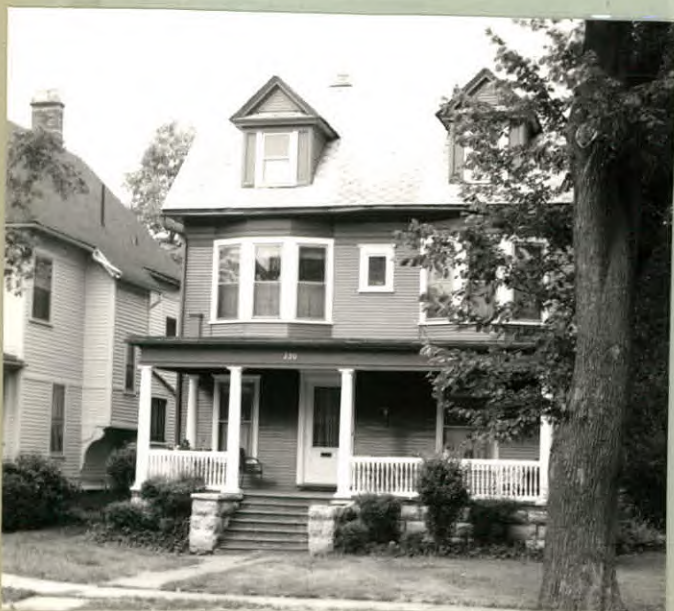
12. PHOTO: 8-8a