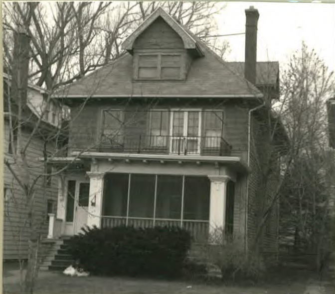
12. PHOTO: 26-28a