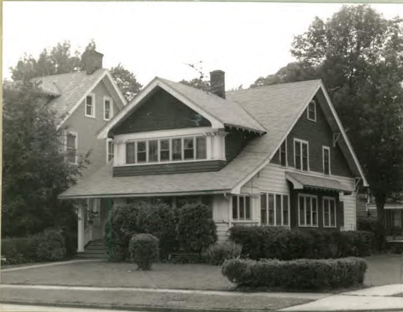
12. PHOTO: 14-34a