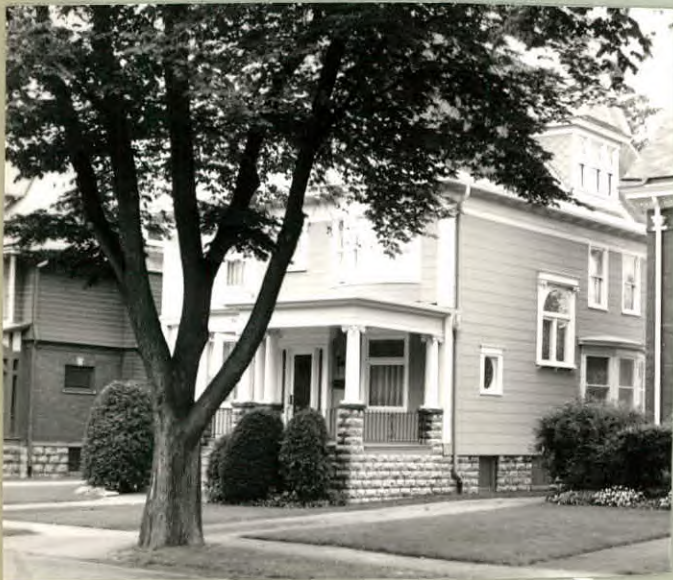
12. PHOTO: 8-12a