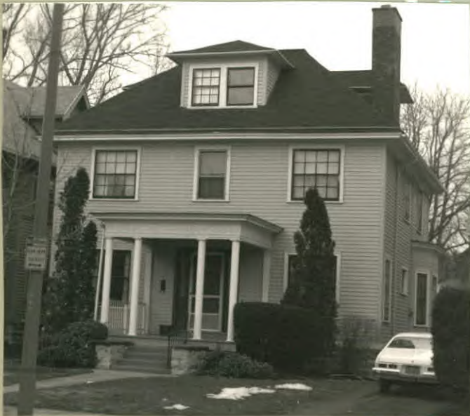
12. PHOTO: 26-27a