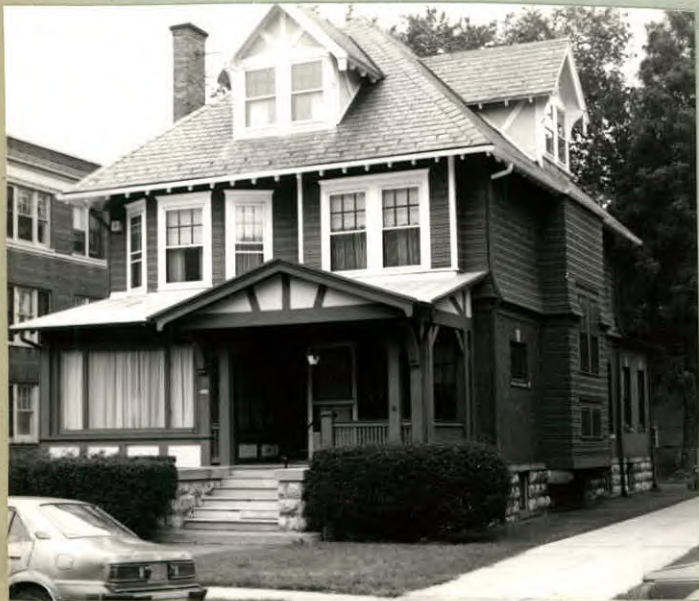
12. PHOTO: 8-13a