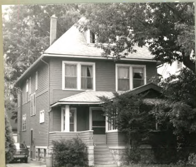
12. PHOTO: 10-12a