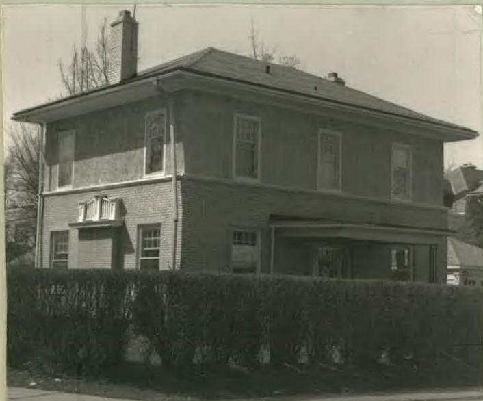
12. PHOTO: 28-4a