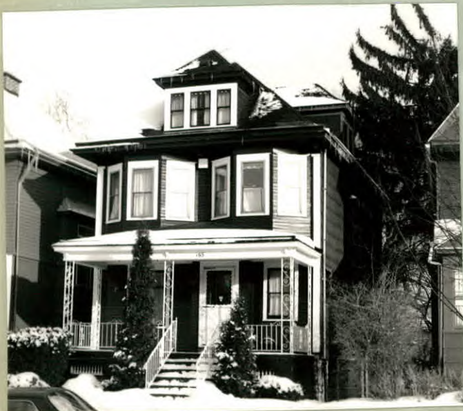
12. PHOTO: 23-37a