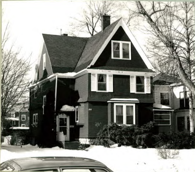
12. PHOTO: 21-8a