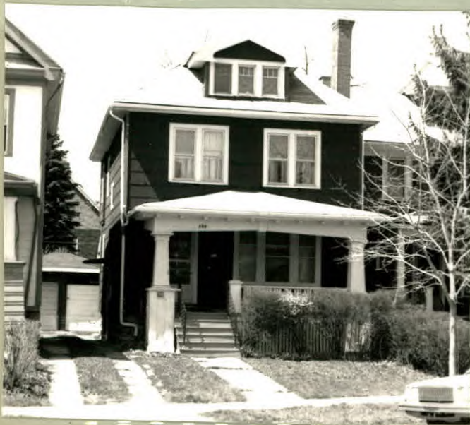
12. PHOTO: 35-20a