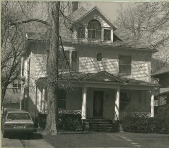
12. PHOTO: 28-1a