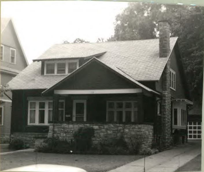
12. PHOTO: 10-18a