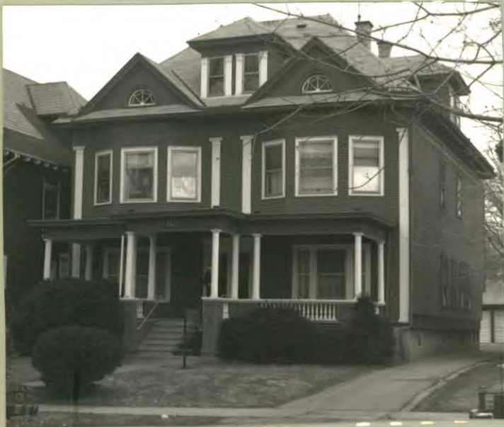
12. PHOTO: 26-18a