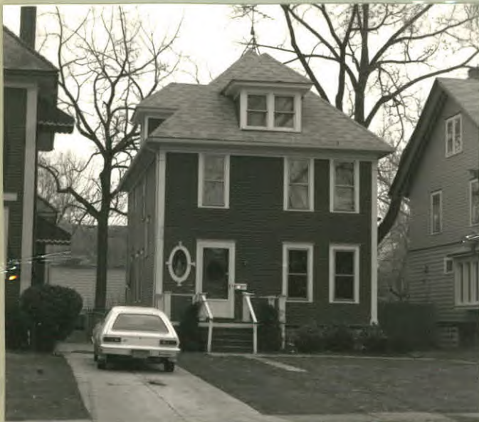
12. PHOTO: 26-16a