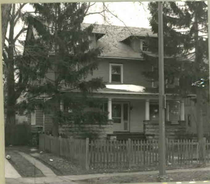
12. PHOTO: 26-15a