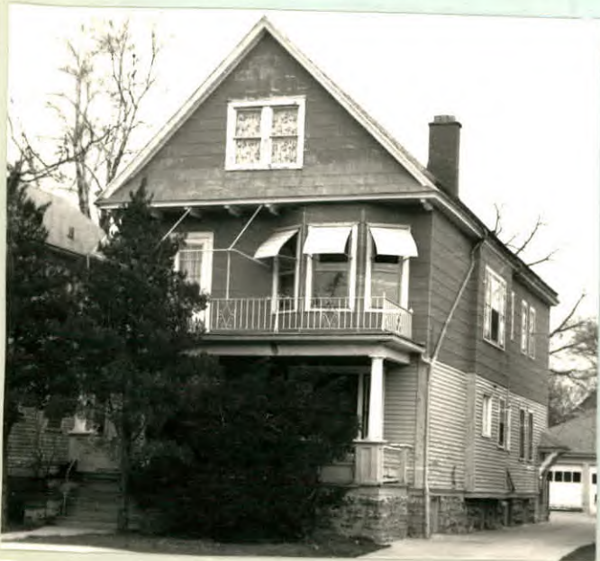
12. PHOTO: 32-33a