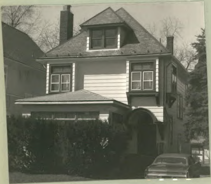
12. PHOTO: 27-33a