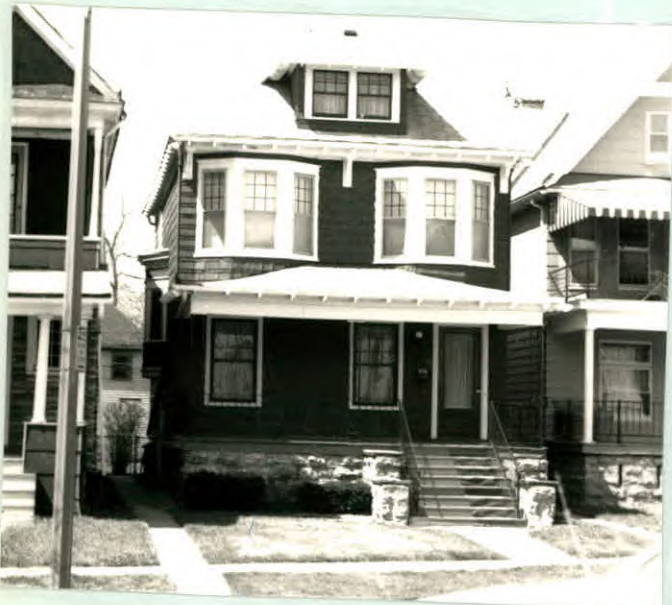
12. PHOTO: 35-15a