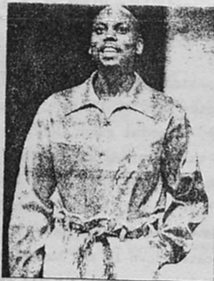
RuPaul models Batanian menswear.

Joking about his bold new fashion statement in the Advocate, a gay magazine, RuPaul says, "It's kind of like Farrah Fawcett quitting 'Charlie's Angels.'" But he's serious about the new testosterone-enhanced image, also on display in the mag. "I'm at a point where I want to explore different parts of myself. In the past I've never felt sexy or appealing as a male. But I do now. And I want to make myself known in the public eye out of drag."