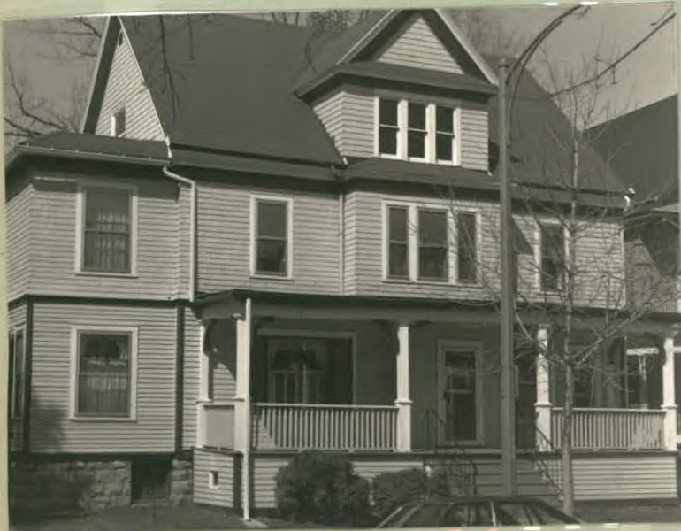
12. PHOTO: 27-30a