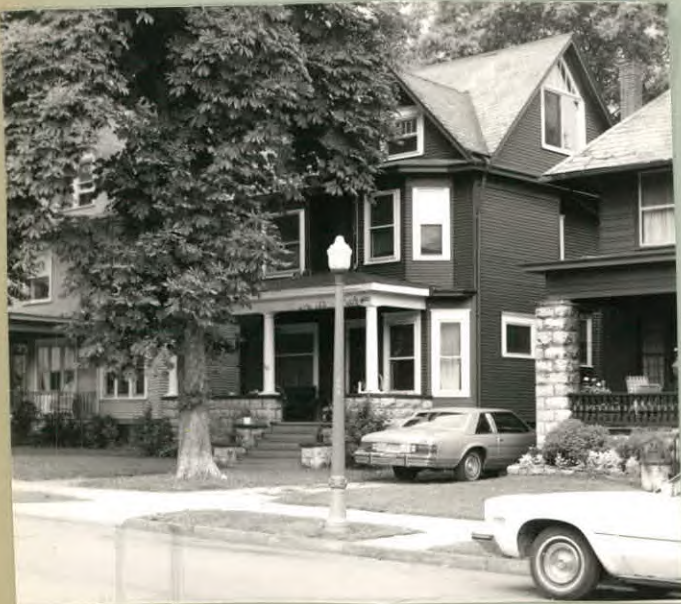
12. PHOTO: 9-6a