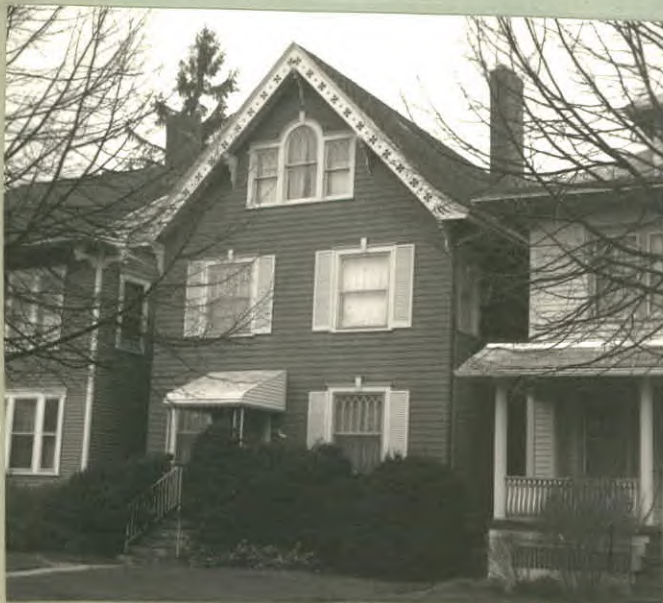
12. PHOTO: 38-26a