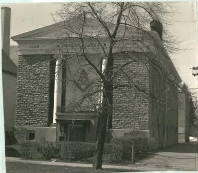
12. PHOTO: 29-30a