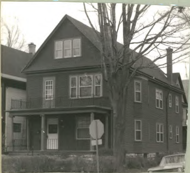
12. PHOTO: 11-17a