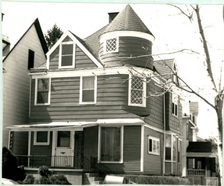
12. PHOTO: 35-12a