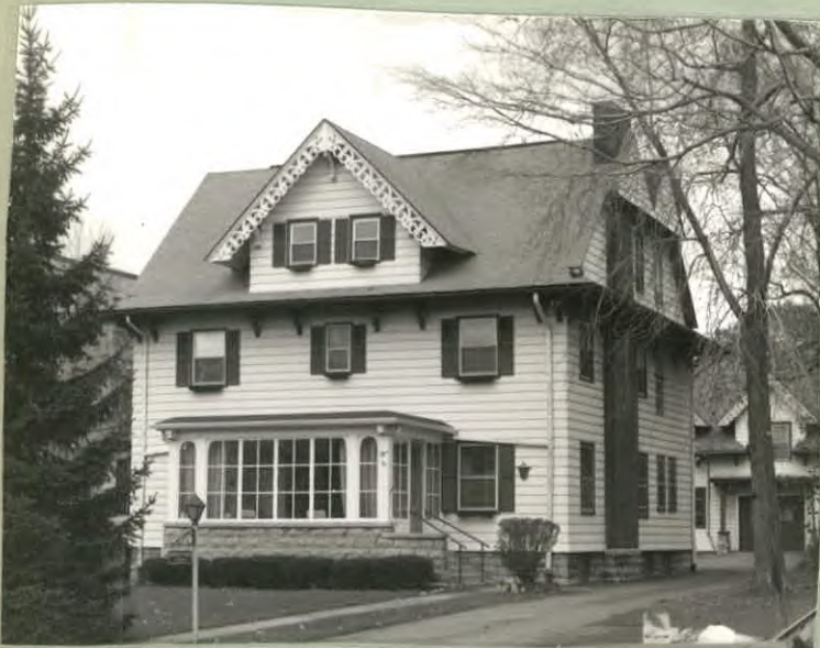
Destroyed by fire - demolished