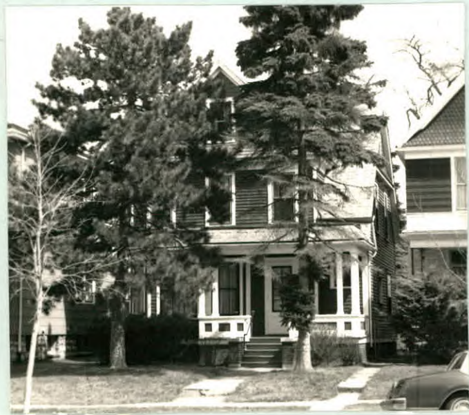
12. PHOTO: 32-25a