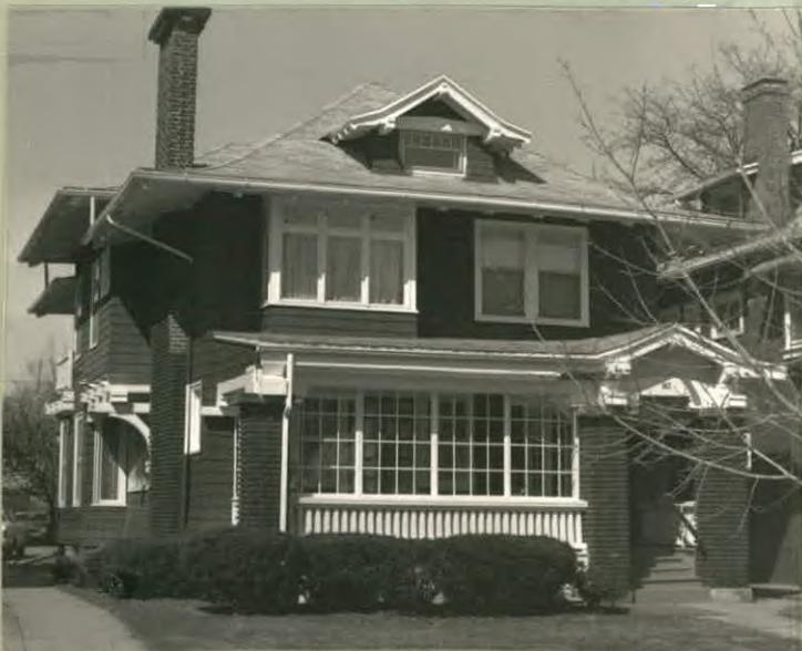
12. PHOTO: 27-25a