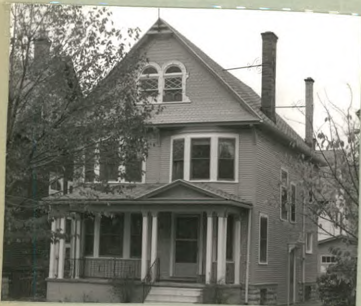
12. PHOTO: 11-15a