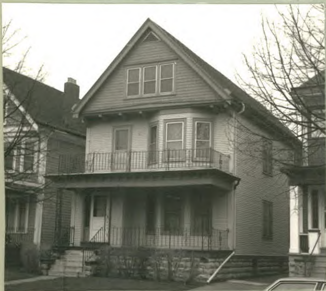
12. PHOTO: 38-30a