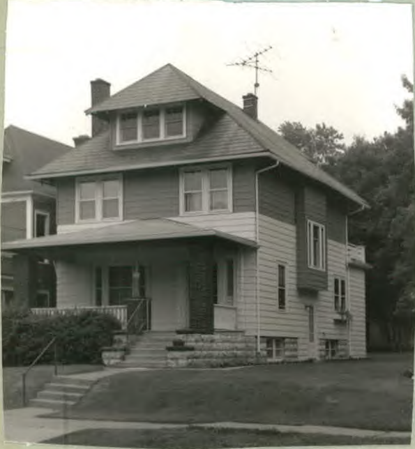
12. PHOTO: /3-26